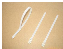
Nylon cable tie

Function: Tie up the bare fiber protective tube and the loose tubes