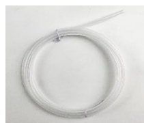
Bare fiber protective tube (8m)