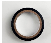
Black insulation tape